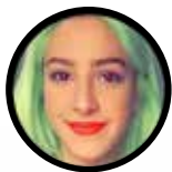
Gabrielle Accessories Designer Landed Her Dream Job