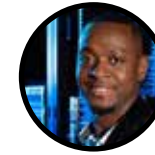
Doddley Manager First Generation College Graduate